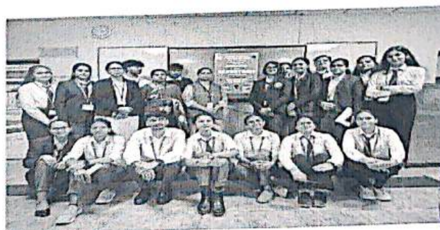
Pic 5: Faculty coordinators and student coordinators