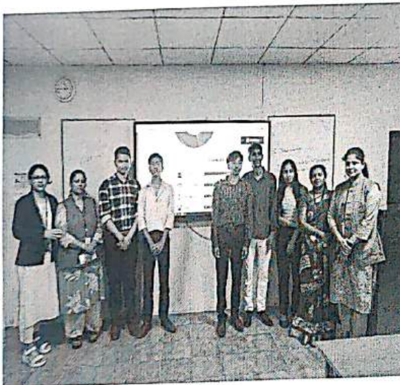
Pic 4: Winners with Faculty Coordinators