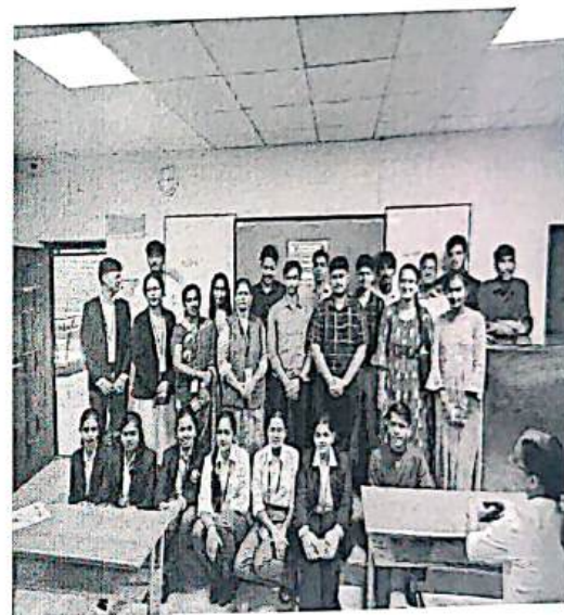
Pic 5: Faculty Coordinators with the participants