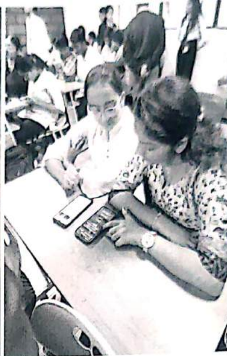
Pic 3 : Students involvement towards the Event