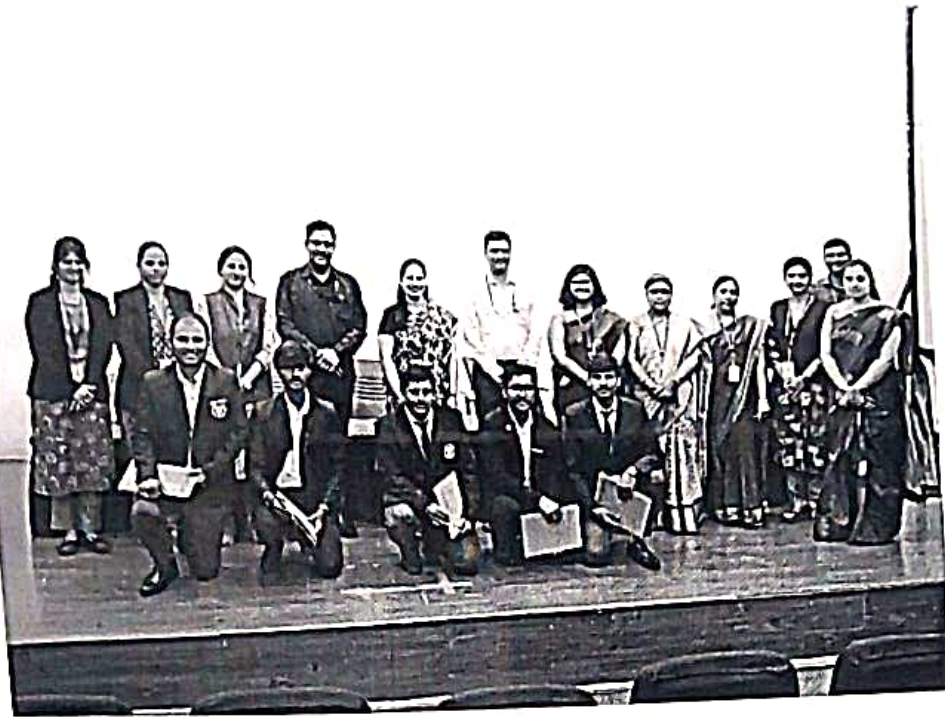
Student Council 2025-26