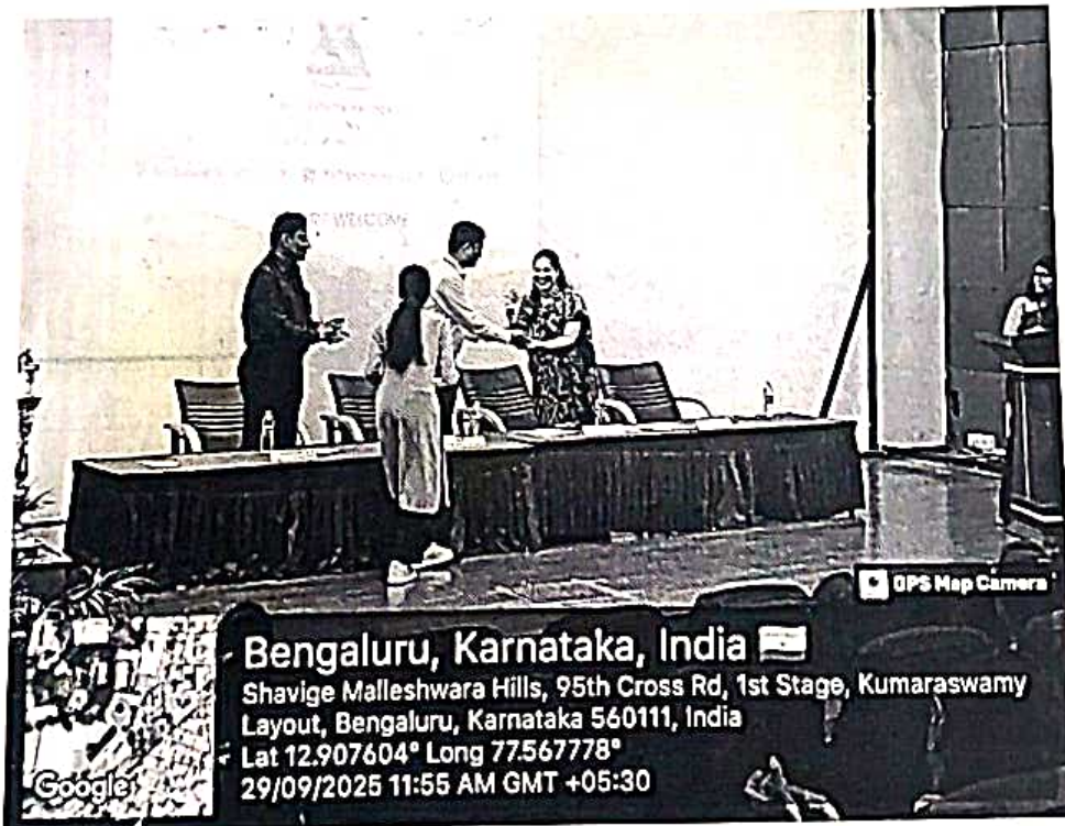
Welcome of Chief Guest