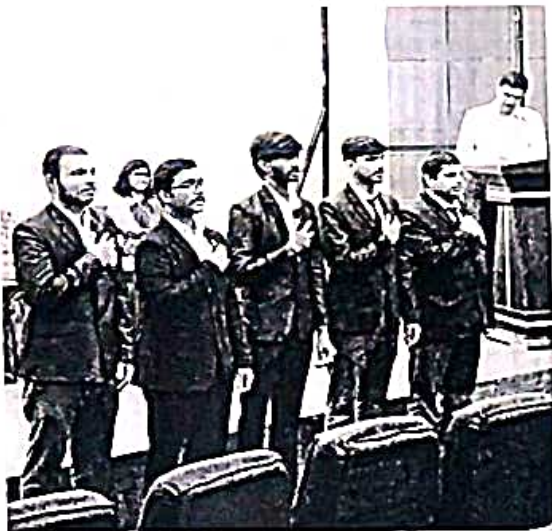
Administration of oath by the Principal