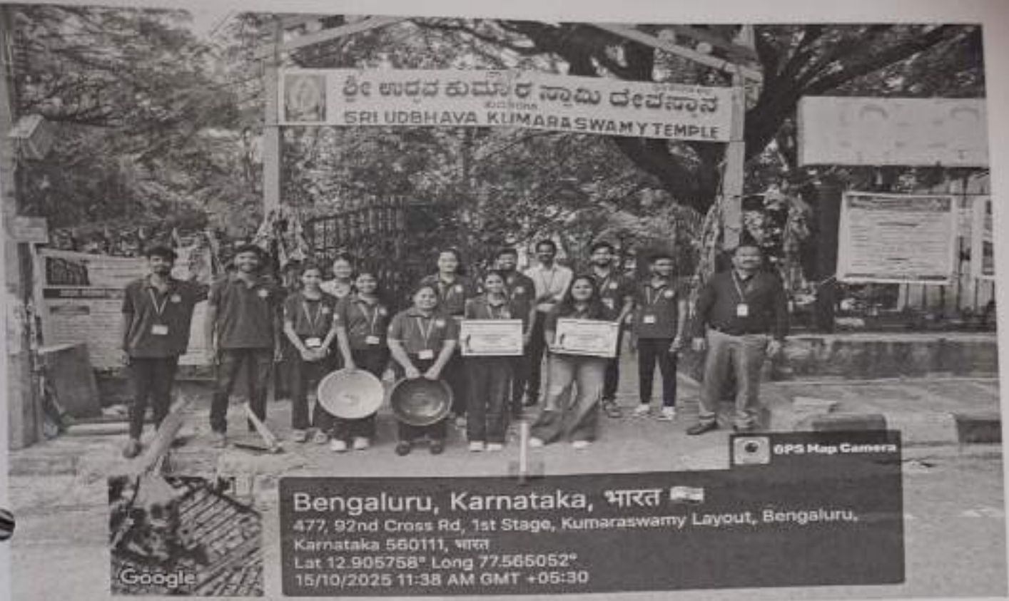
Bengaluru, Karnataka, भारत 477, 92nd Cross Rd, 1st Stage, Kumaraswamy Layout, Bengaluru, Karnataka 560111, भारत Lat 12.905758° Long 77.565052° 15/10/2025 11:38 AM GMT +05:30