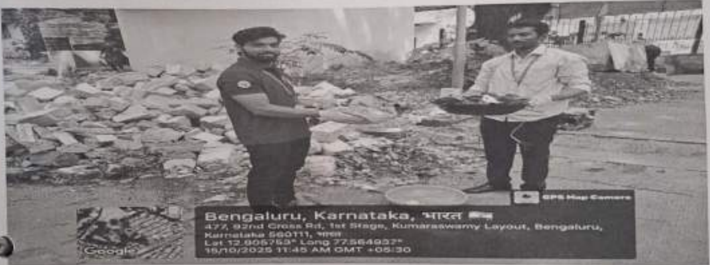
Bengaluru, Karnataka, भारत 477, 92nd Cross Rd, 1st Stage, Kumaraswamy Layout, Bengaluru, Karnataka 560111, भारत Lat 12.905753° Long 77.564937° 15/10/2025 11:45 AM GMT +05:30