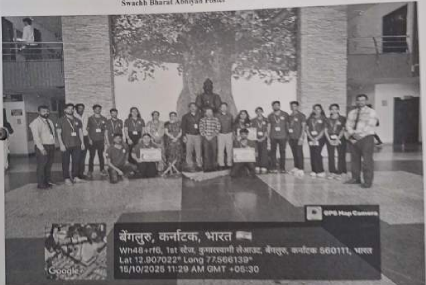
Swachh Bharat Abhiyan Poster