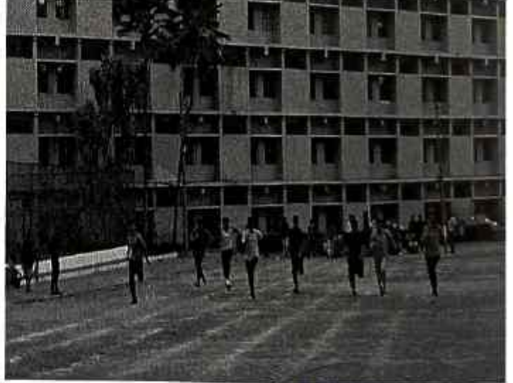
Physical Fitness Test: running (200m for boys, 100m for girls) push-ups, and pull-ups etc.