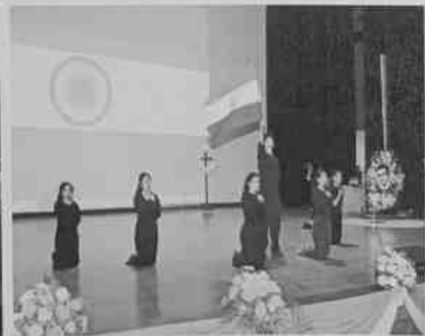
A Dance Performance by Team TAAL TARANG.