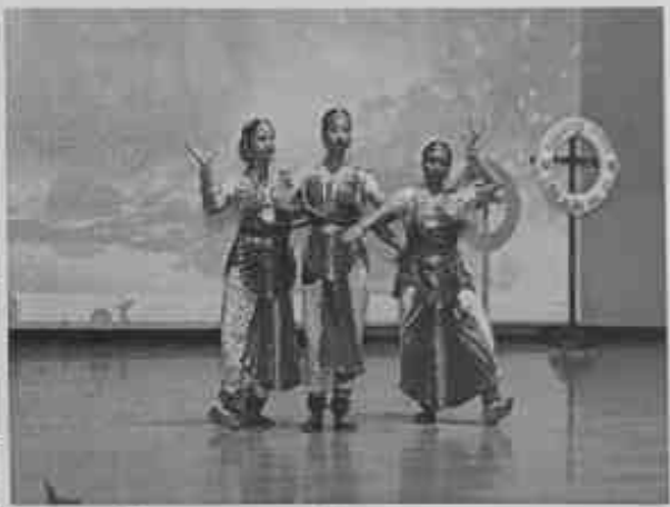
The NCC Cadets performed an invocation Bharatanatyam dance.