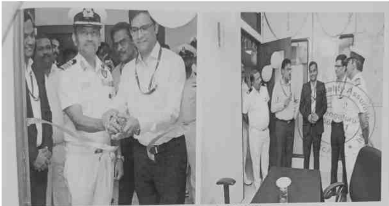
Formal Inauguration of ANO Office.