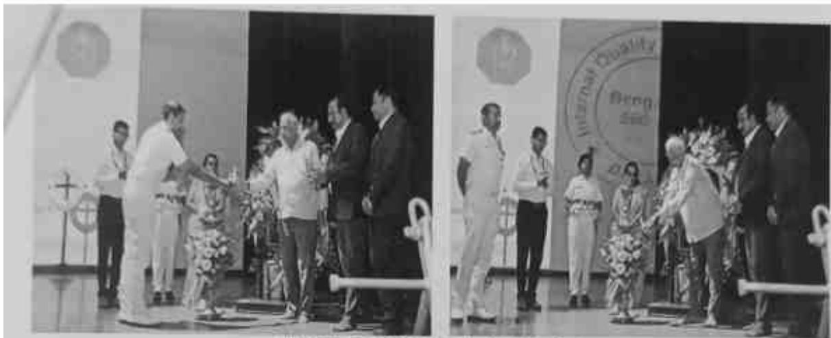
The lighting of the lamp by the Dignitaries.