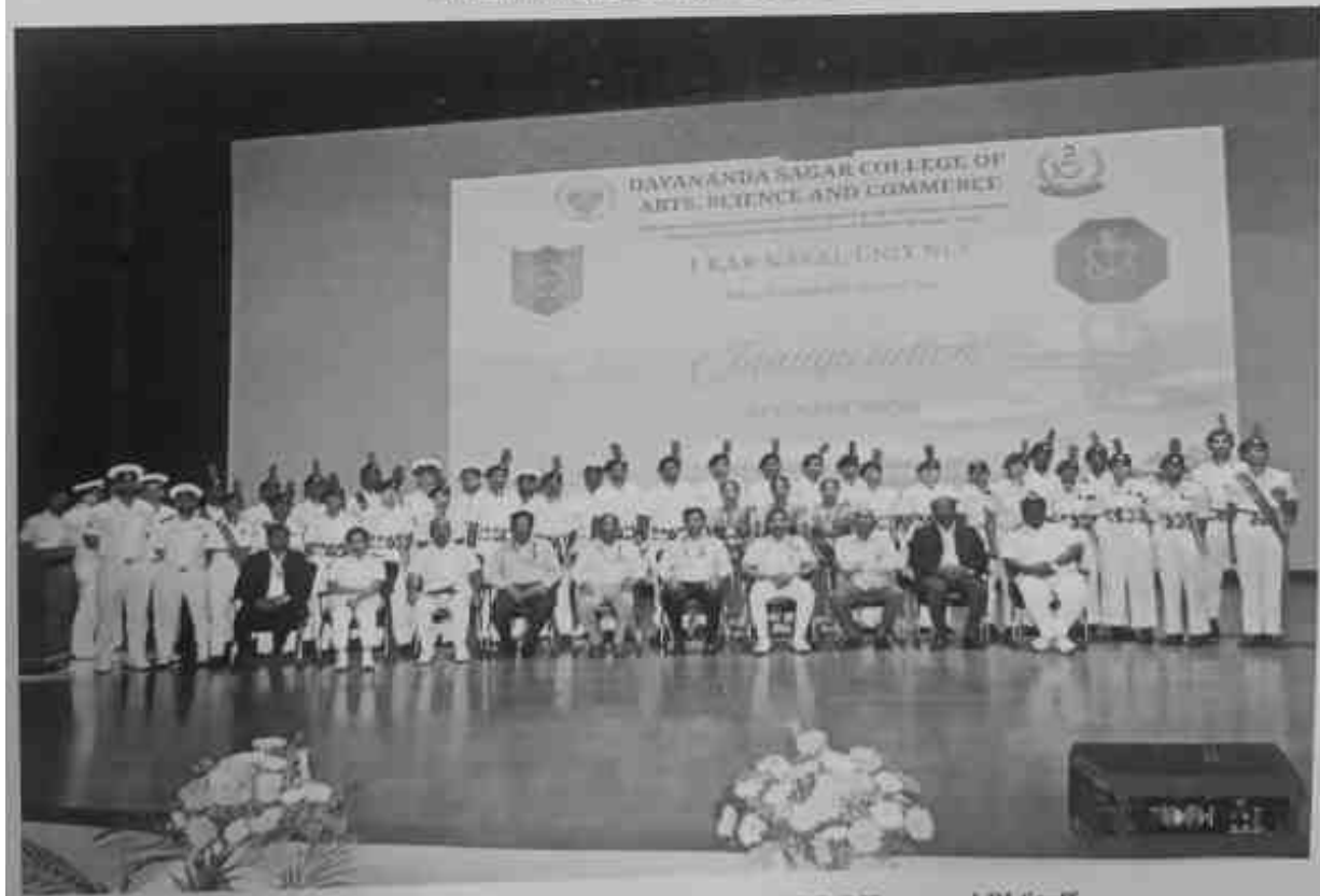
NCC Cadets Group Photo with Dignitaries, NCC Officers and PI Staff.