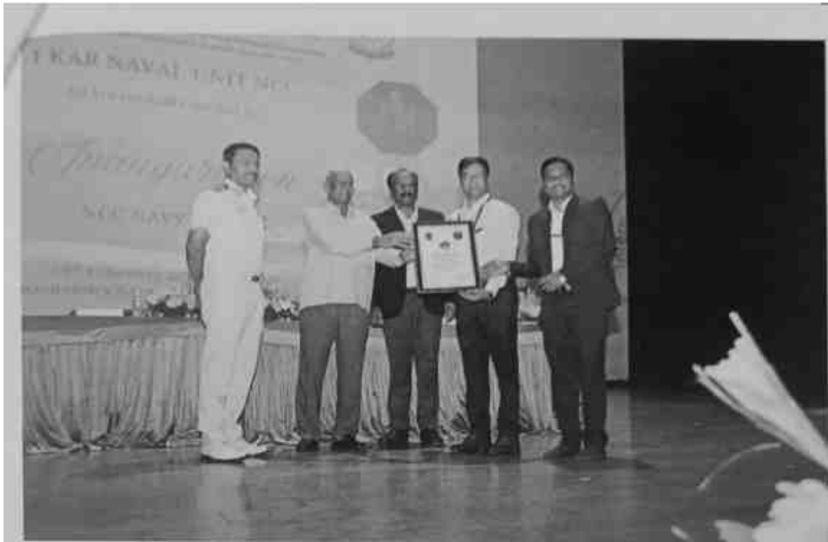
Commissioning Ceremony of the Naval Unit, NCC