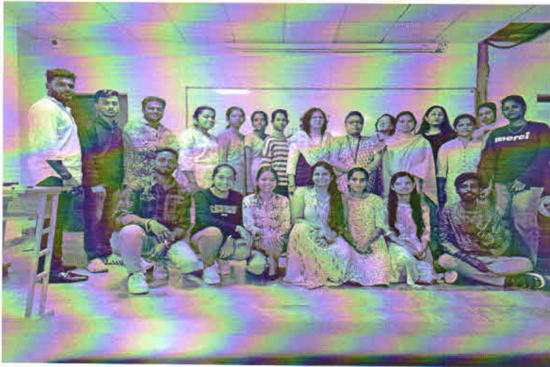
Prize winners of IQ and Quiz competition