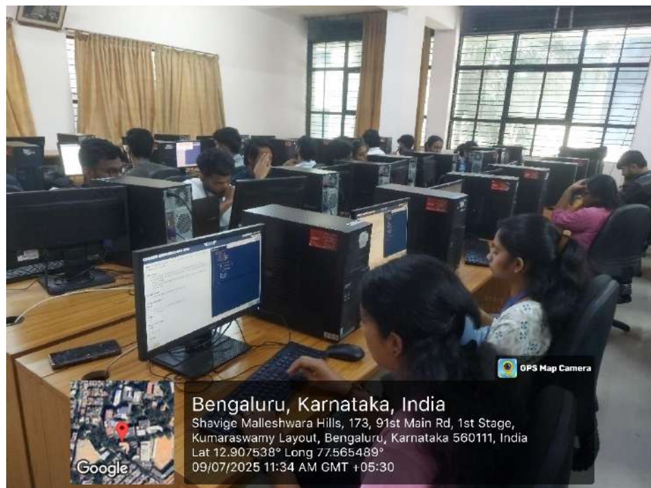
Pic(2). Participation of the students in round one of the Event