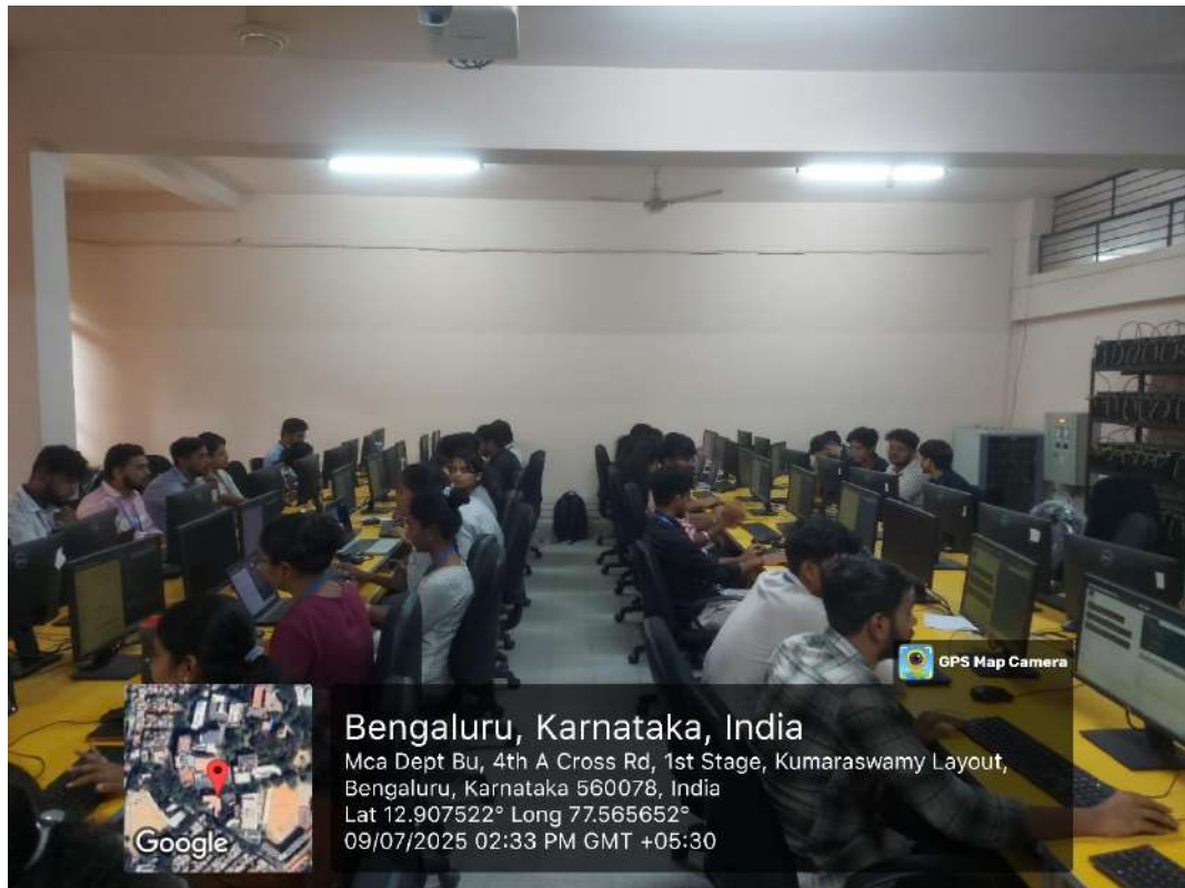
Pic(3). Students participation in round two