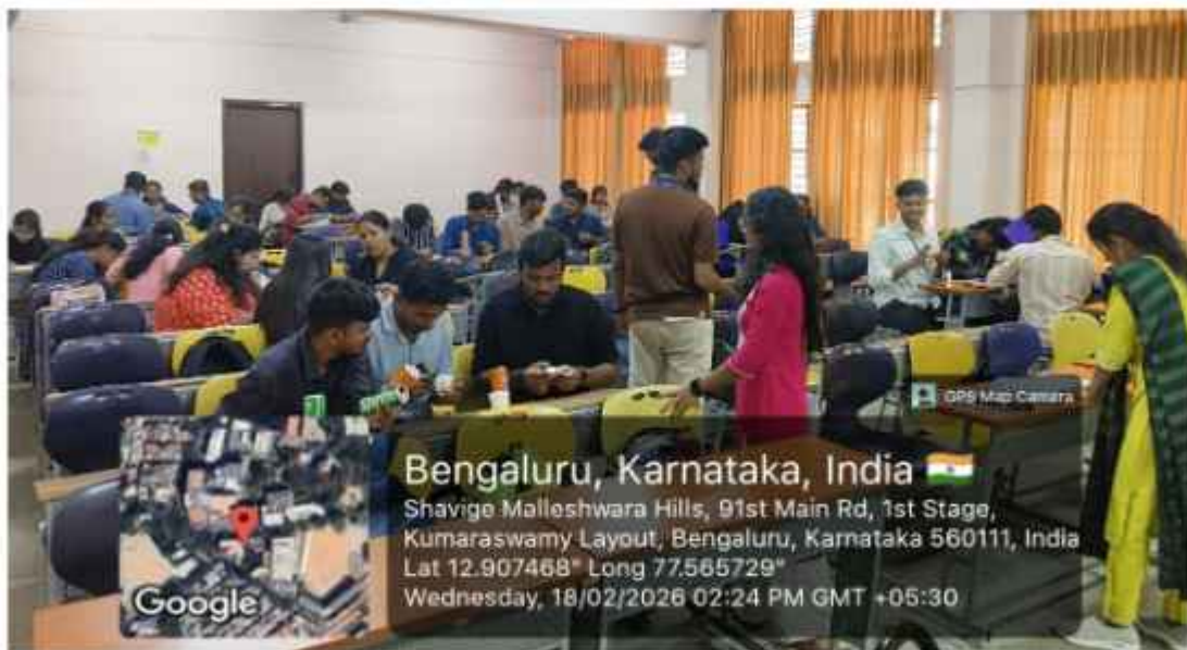
Photo 2. Team work with creative outcome of the activity