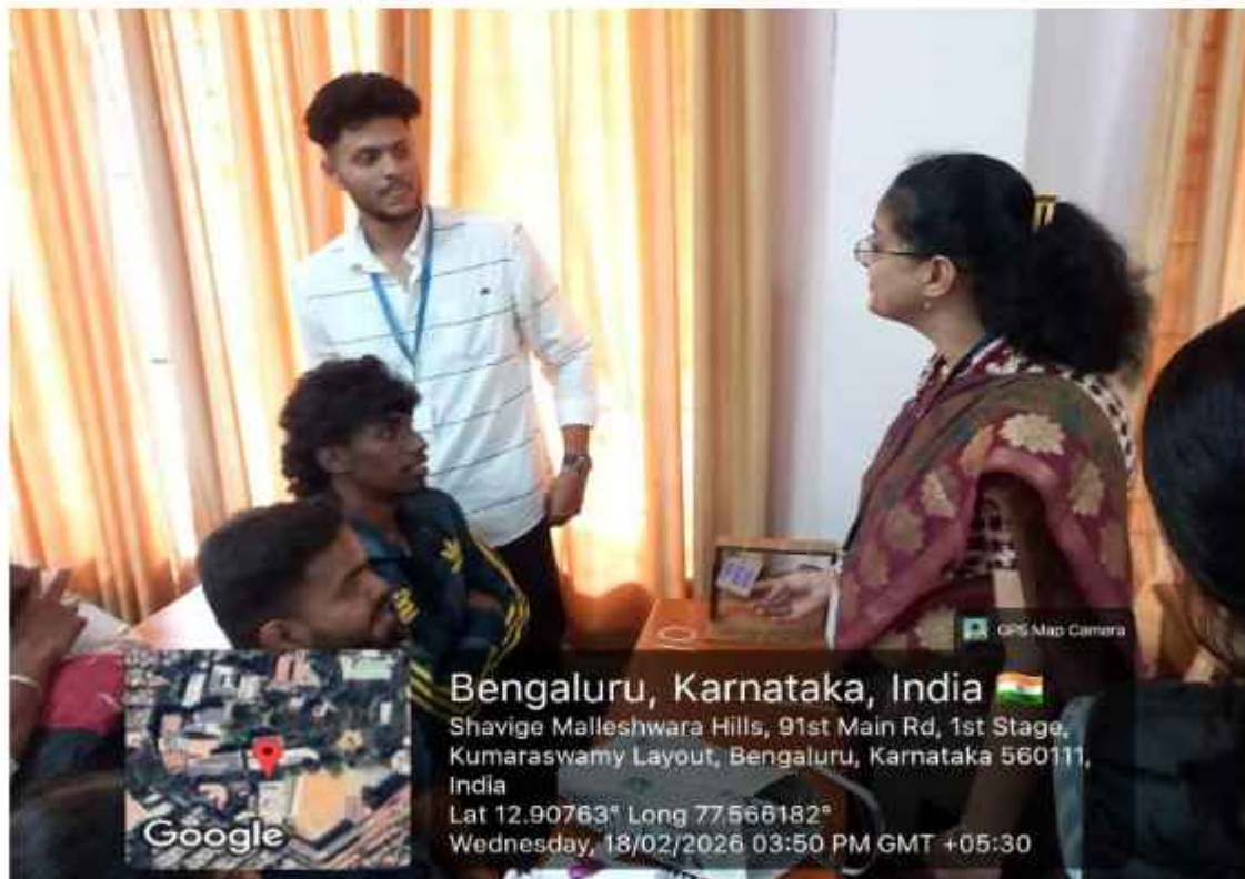
Photo 4. Activity interaction between the HOD and students