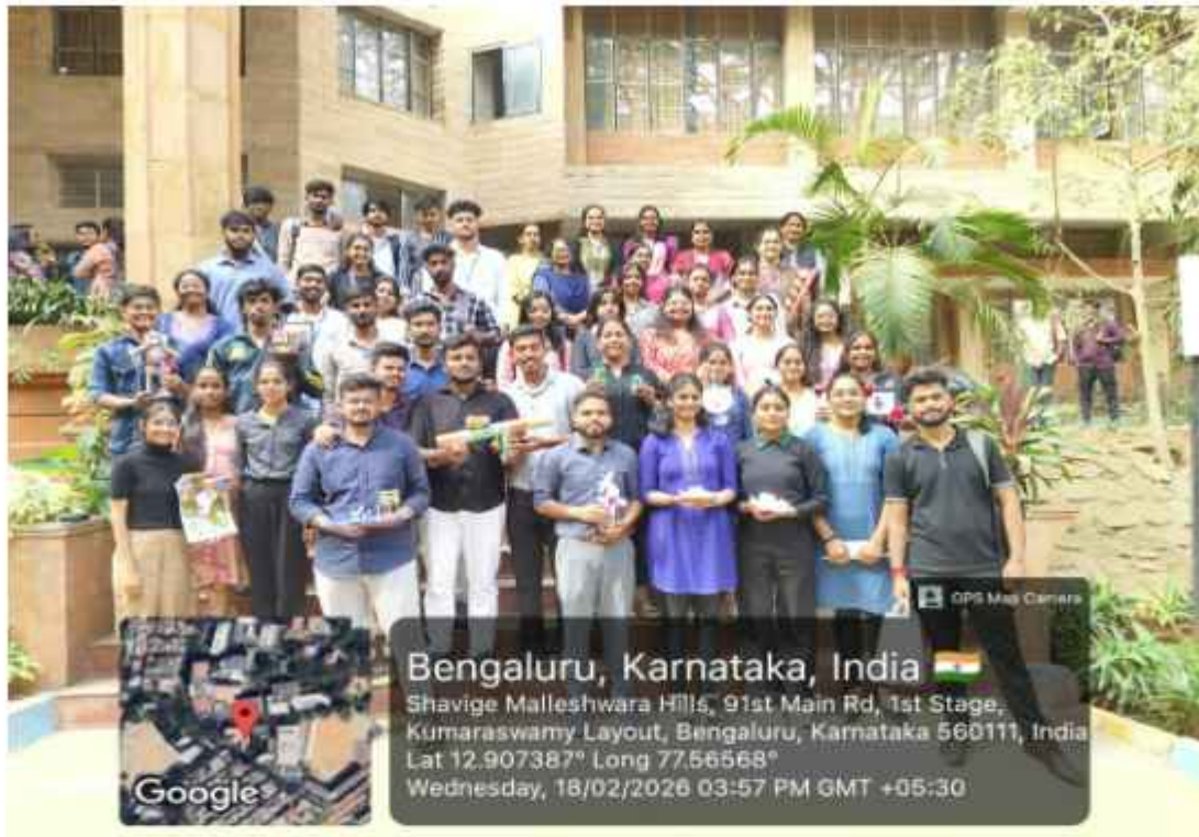
Photo 3. Celebrating creativity & sustainability- group photo