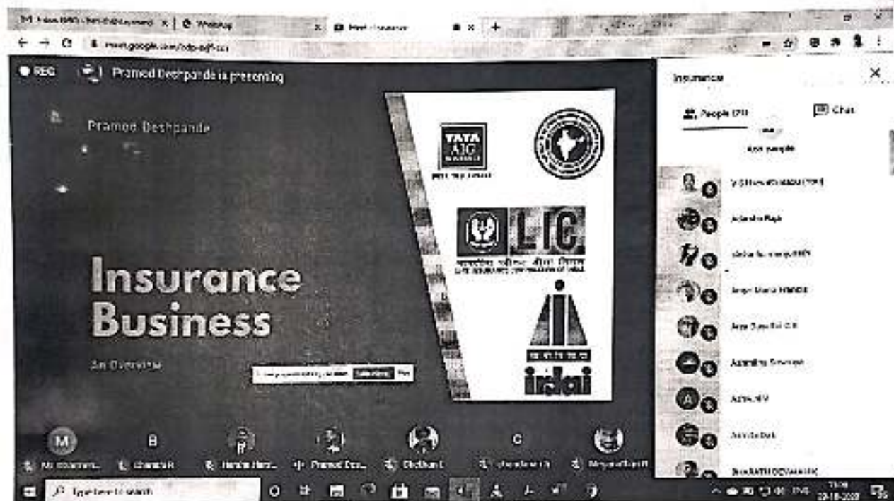
Photo 1: Mr. Pramod Deshpande is presenting ppt on Insurance overview