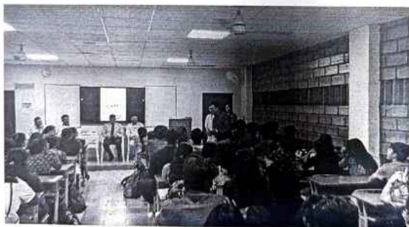
Photo 2. The principal addressing the students