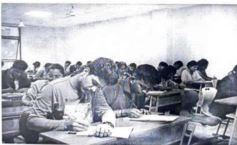
Photo 4. Student participants participating in the Competition.