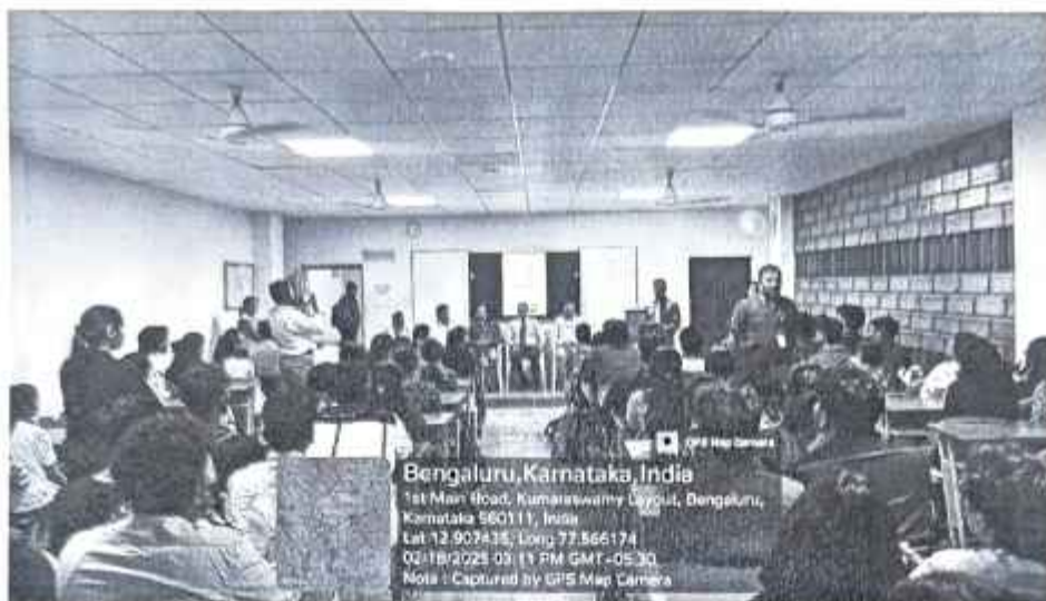
Photo 3. Student participants