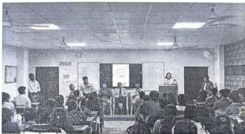
Photo 1. Welcoming of the Guests.