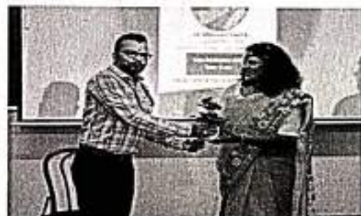
Welcome to the speaker by B.Com-HOD