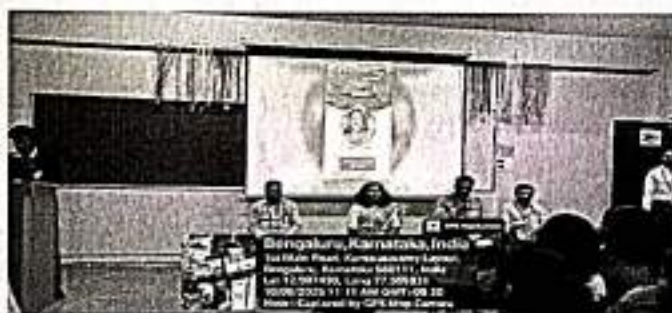
A Welcome note to dignitaries