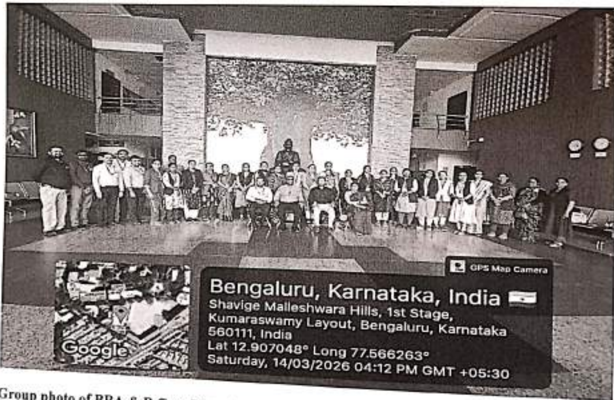
Group photo of BBA & B.Com Department Faculties with Principal and Hods