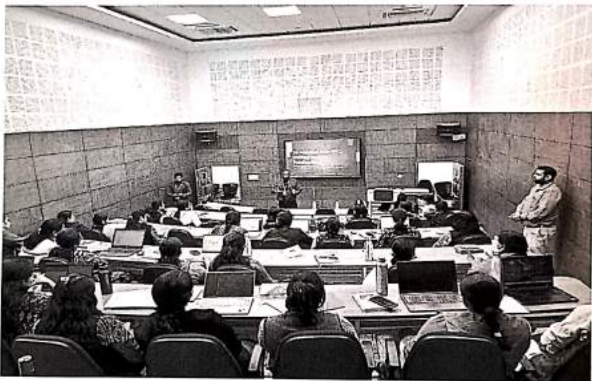
Participants actively listening and working out with AI tools