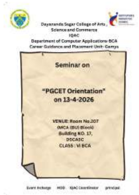
Photo 1-PGCET Poster