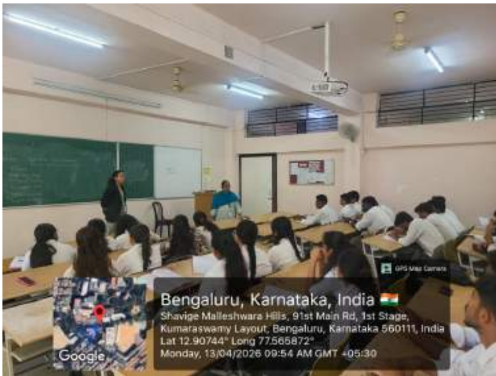
Photo 3- Explaining the procedures involved in PG CET Process