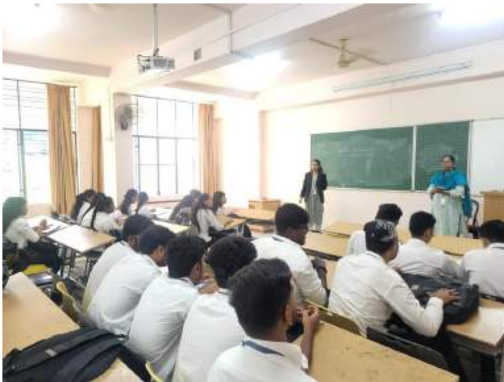
Photo 4- Students Participation