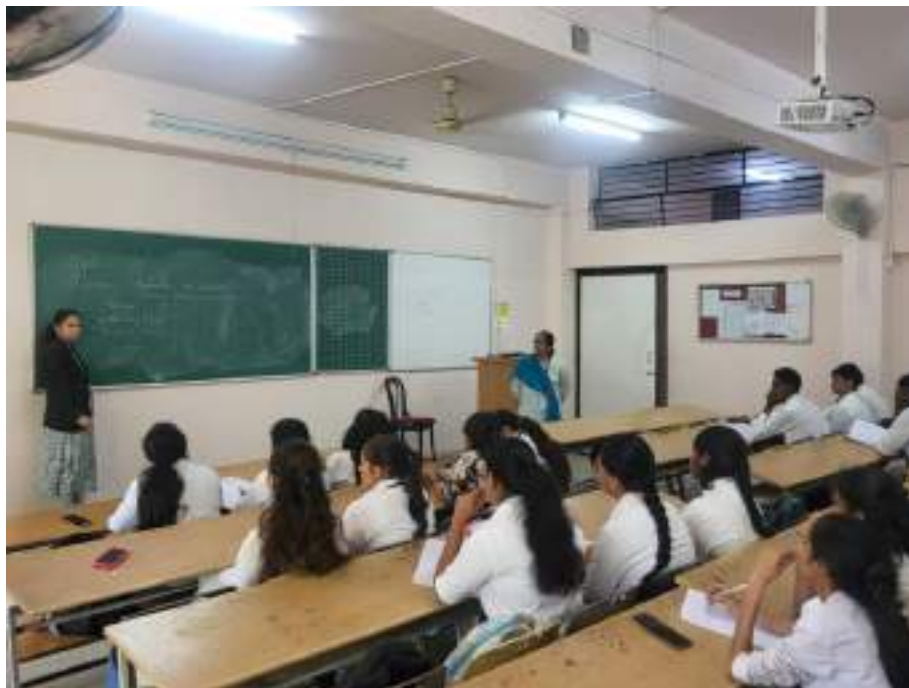
photo 2- Discussing the syllabus