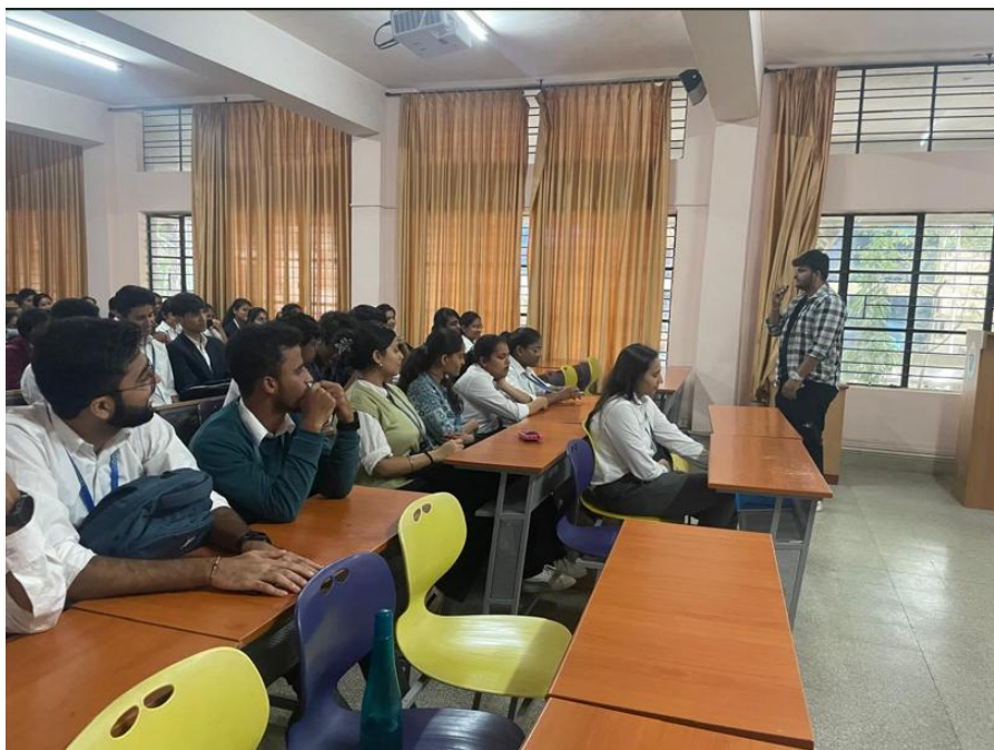
Photo 3 : Specifically explaining the preparation required for internship and job