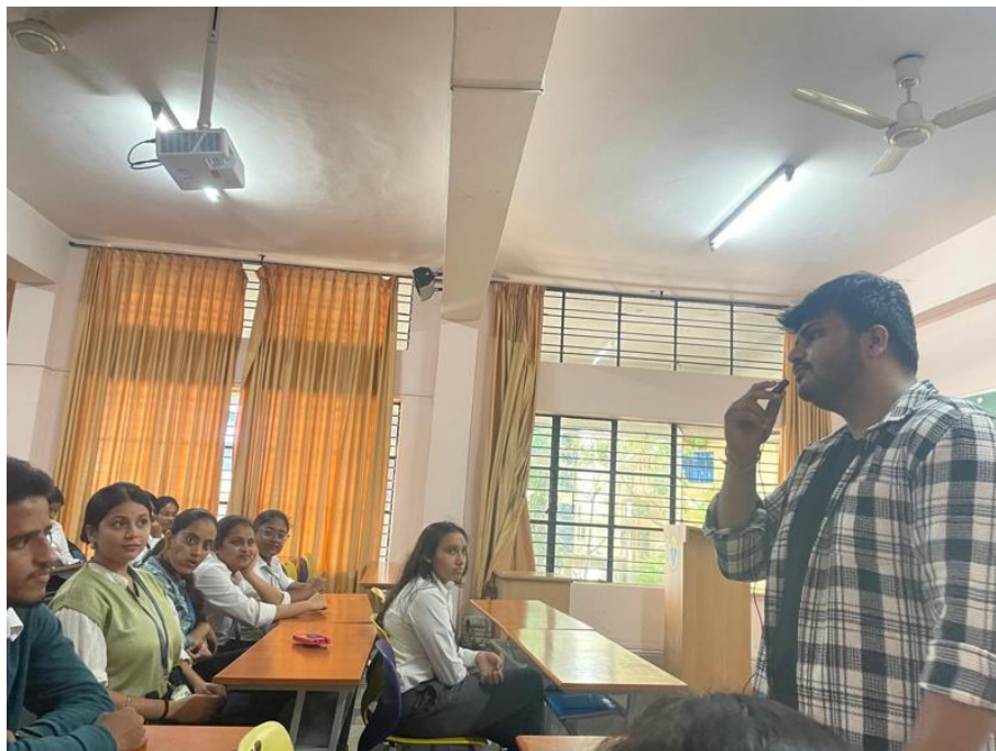
Photo 2 : Addressing the BCA students and asking them about programming languages