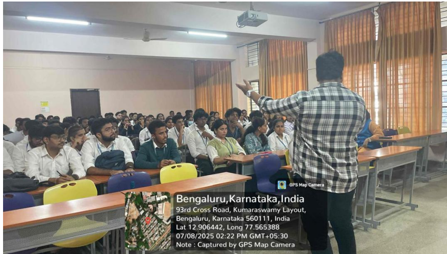
Photo 1:Addressing the students and taking their input regarding projects and internships