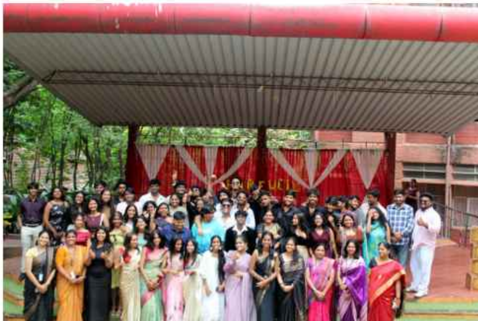
Pic 2 : Capturing Memories with final year students