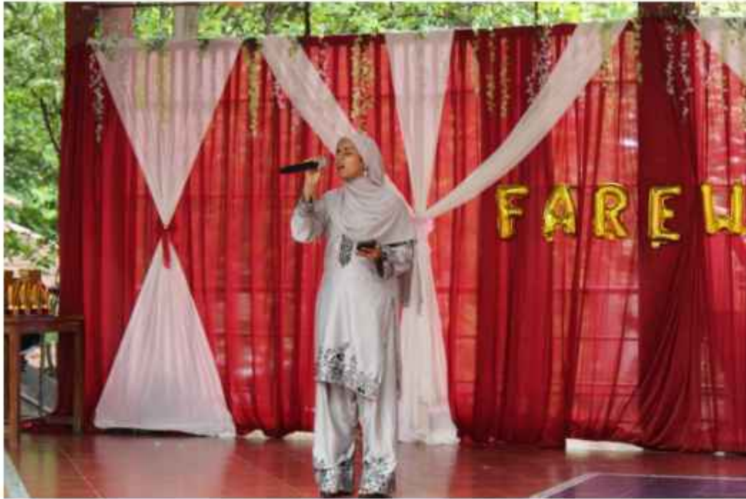
Pic 3: Student Showcasing their talent