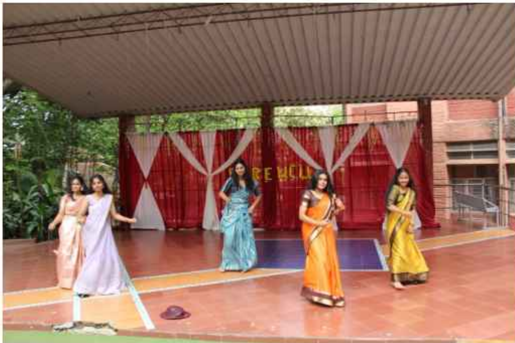
Pic 4 : Performance by Juniors