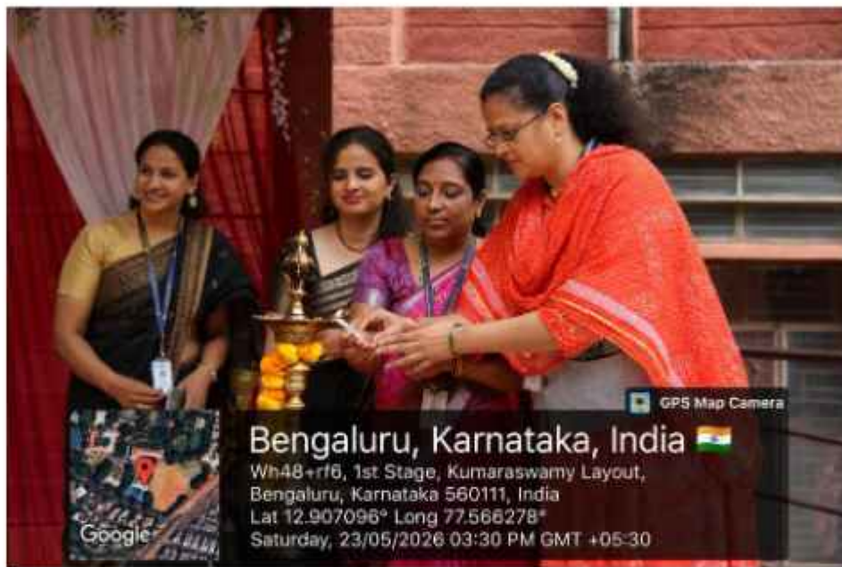
Pic 1 : Lighting the lamp