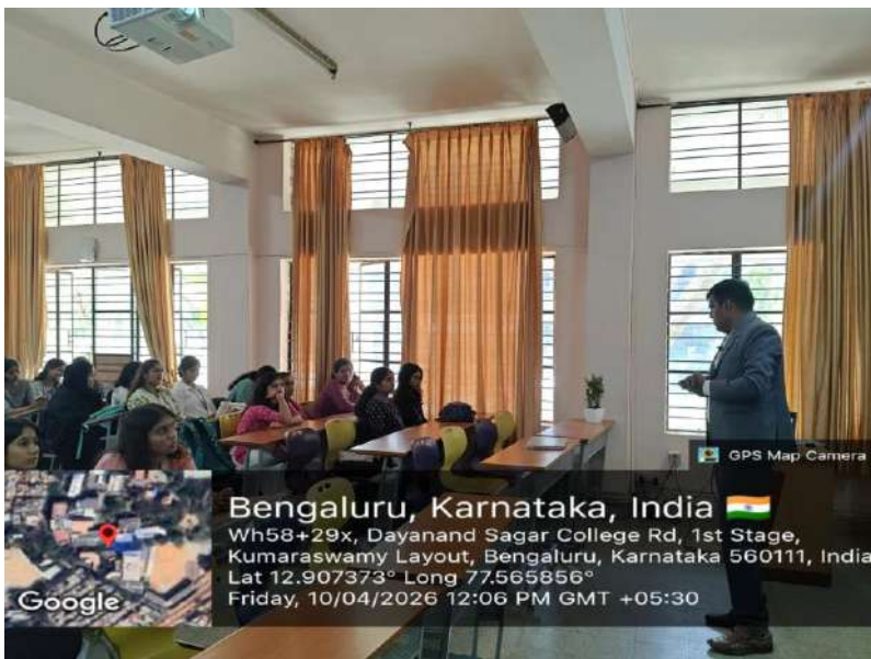
Photo 4- Resource person giving an insights of Industrial Requirement