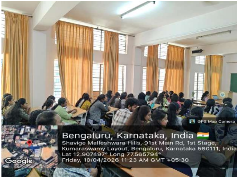
Photo 3- Students Participating in Group Discussion