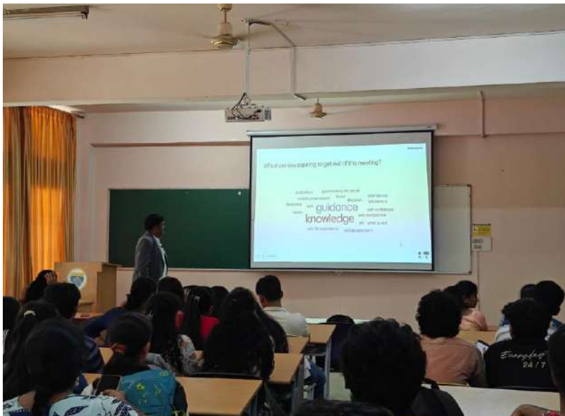
Photo 2- Students Participating in the Activity