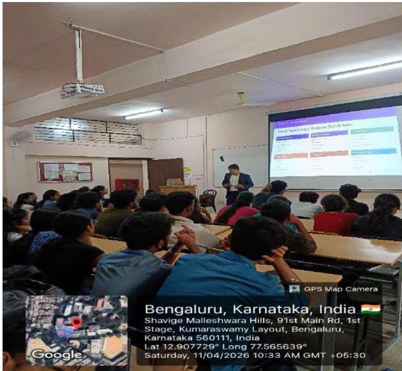
Photo 3- Speaker Explaining Integrating Tools Of AI