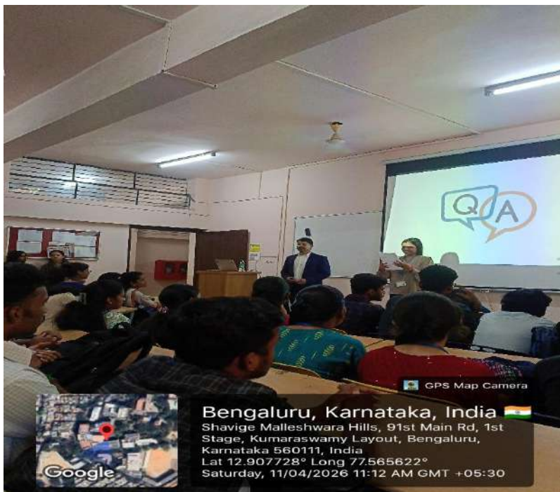
Photo 4- Students Participating in Quiz