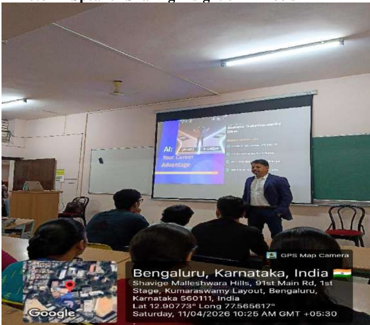
Photo 2- Students Participating in the Activity