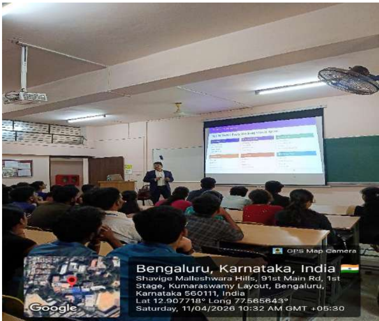
Photo 1 - Speaker Sharing Insight of AI Tools