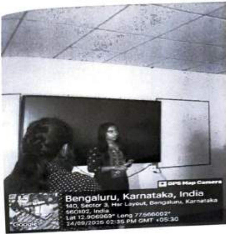
Pic-2: Round 1 Talk with Walk