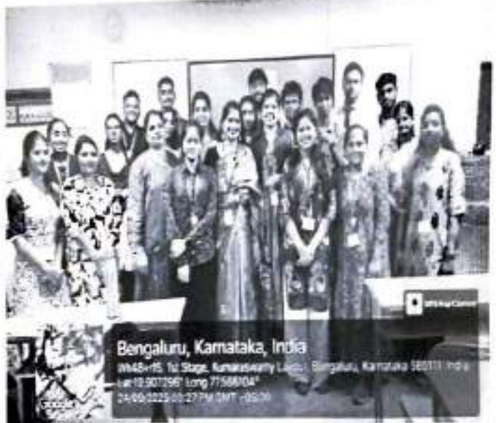
Pic:5:HR Club Co-ordinators with Participant