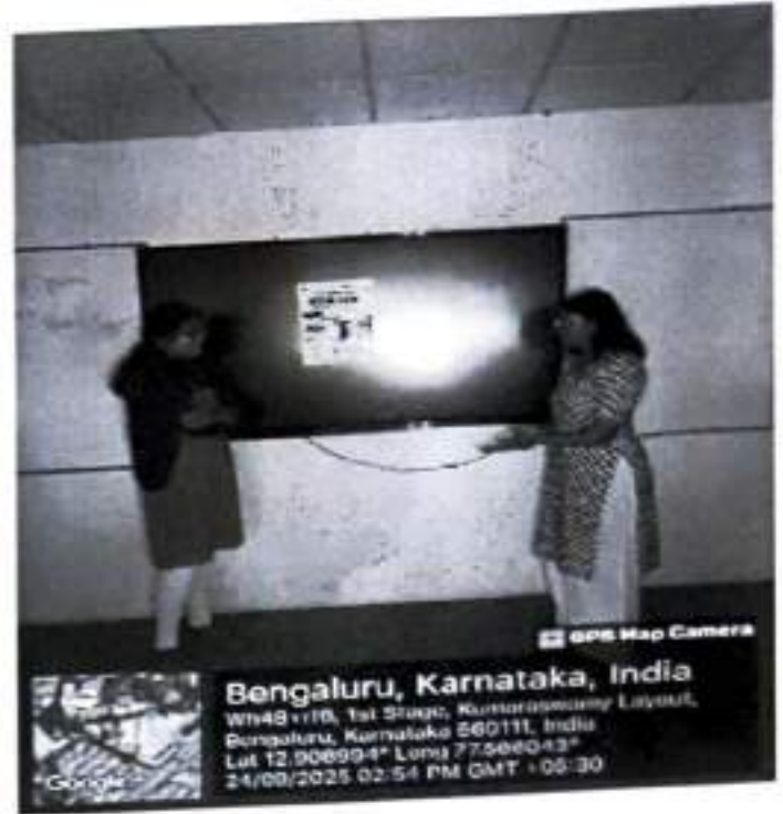
Pic-3: Round 2 One Vs other