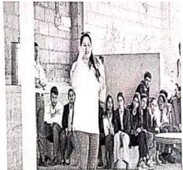
Photo 2& 3 : Co-founder explaining about the operations at Isiri farm