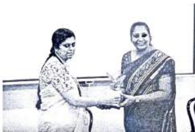
Welcome to Guest by BBA-HoD