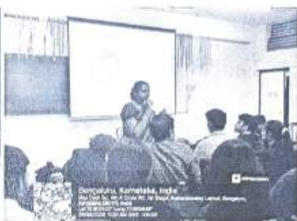
Address by the Speaker